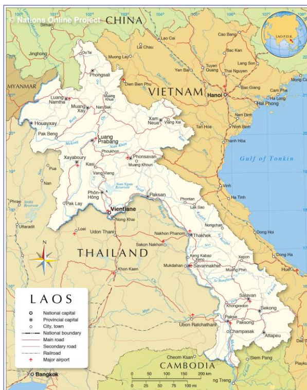
Figure 1: Map of the Lao People's Democratic Republic