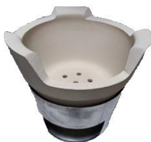
Figure 2: Photo of Green Benefit Improved Cookstove

The technical specifications of Lao Energy Saving Improved Cookstove are shown below. Its thermal efficiency is 33%.