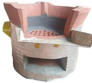
Figure 3: Photo of Lao Energy Saving Improved Cookstove

The cooking systems of two types are both made of a combustion chamber, a pot rest and an air inlet window. The lifespans of the two types of improved cookstoves are both expected to be 7 years.